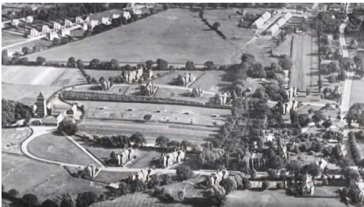
Shirley Oaks children's home