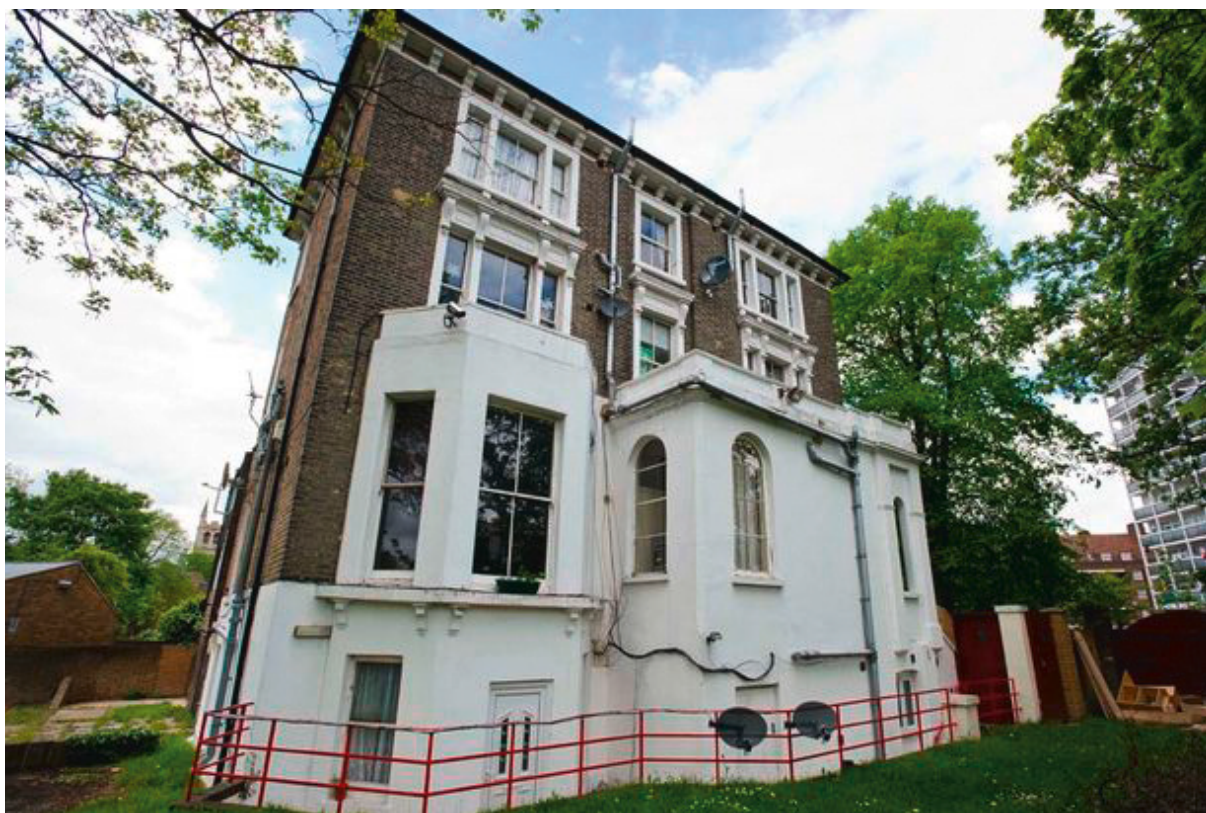
Angell Road children's home